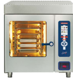
Genius T 6-11 left hinged door and Multi-Eco-Hood KH 2