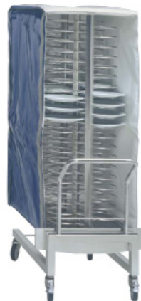
Banquet system with thermal insulation hood 6-11: 18 plates, 10-11: 32 plates; 20-11: 62 plates; 12-21: 77 plates; 20-21: 120 plates

-Banquet system: Trolley with plate stacks . -Vario rack with 6 or 10 slides makes it possible to use standard GN and 400 x 600 mm trays. -Eloma warming cabinet with humidification also serves as proover. -Support stand for GN grids also manufactured by Mac Brothers.